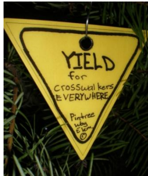
educational tool: Winter Solstice Tree Ornament