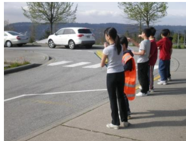
Gr. 5 student leaders assessing the student/vehicle ratio

Urbanthinkers will work with a small team of student leaders in each school to reduce vehicle-trips to school by 20% this spring. With an emphasis on walking to school, the student committees will focus on strategies to get their peers to;