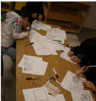
design phase: students take parent feedback to refine designs

Each week from December 18, to January 22, 2010, the children of Pinetree Way sent safe driving educational messages home and into the community."